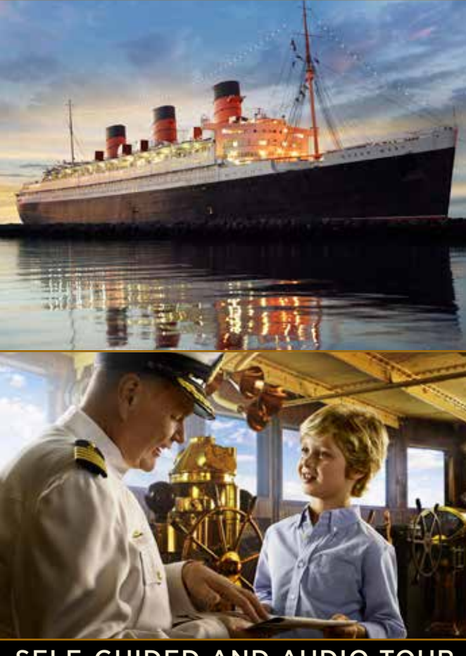
SELF-GUIDED AND AUDIO TOUR